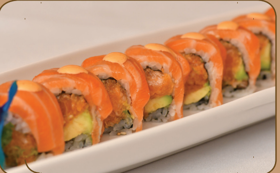
Salmon Lover Maki