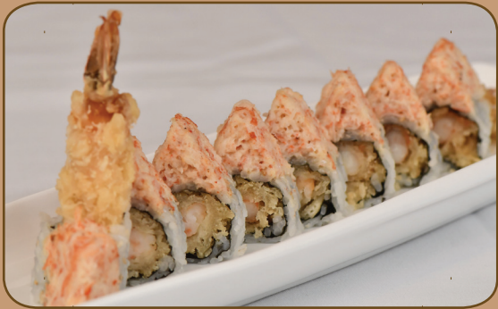
Snow Mountain Maki