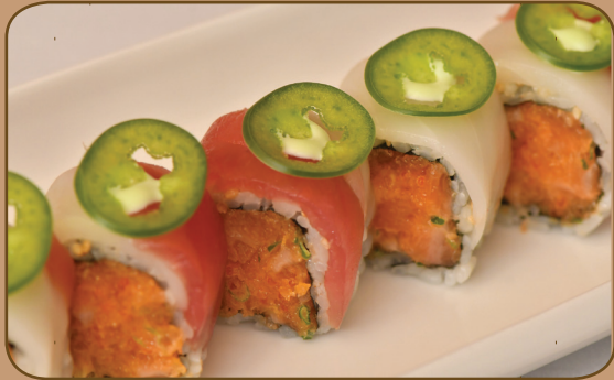
Kiss the Fire